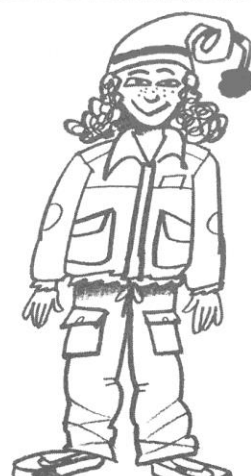
Hi, My name's