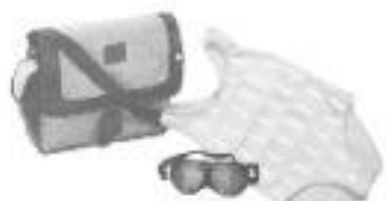
This is Sarah's bag.