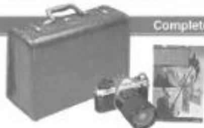
This is Bill's suitcase. He is going to take photographs and read a book.